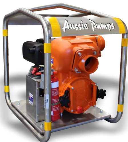
QP40T MS .. Mine Boss configuration (see page 3)