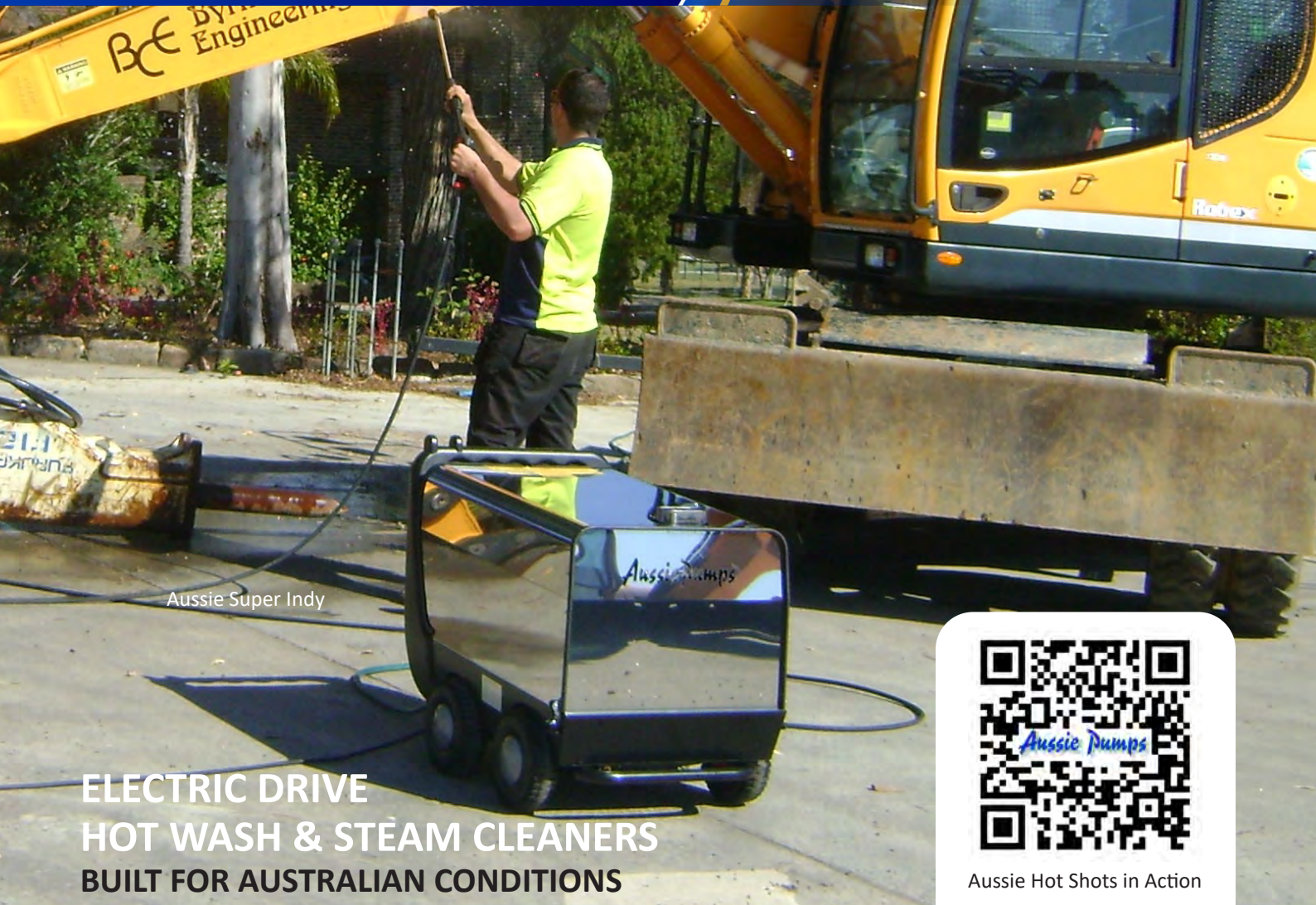
Aussie Super Indy