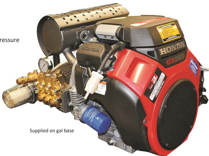
Supplied on gal base