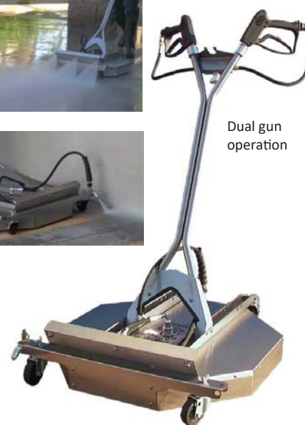
Dual gun operation