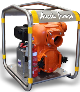
Trash pumps ... Dirty water solutions