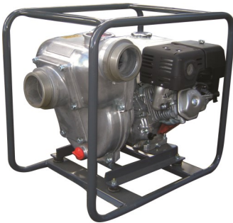
Transfer pumps ... Move water fast