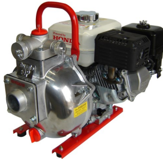
Fire Pumps ... World's best portable range