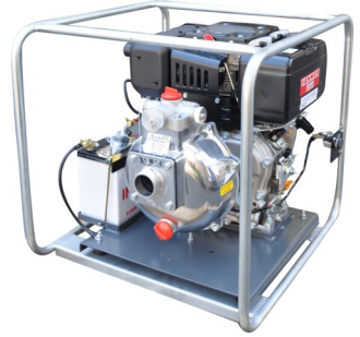
Twin Impellers ... Extra performance