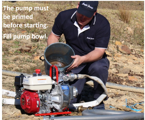
The pump must be primed before starting. Fill pump bowl.

Never attempt to operate pump without priming first. Extended dry operation will destroy pump seal.