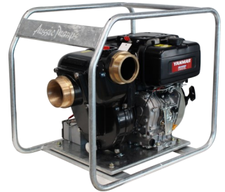
Marine pumps ... Corrosion resistant