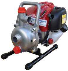
Ultralites ... Portable pumps